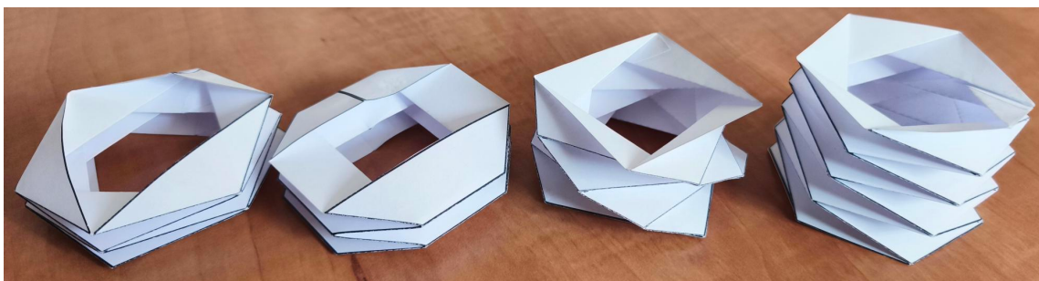
Figure 2: All variants from two worksheets in folded and glued form

All the variants created by stacking the folded strips from the previous task can be found in Worksheets 1 and 2 (if you want to glue the side edges together, you just need to add tabs for gluing). The following figure shows the variants from the worksheets folded and glued.